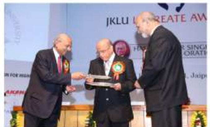
Dr. K. Kasturirangan, former Member of Rajya Sabha and former Chairman of the Indian Space Research Organisation, receiving the JKLU Laureate Award 2014 from Shri Bharat Hari Singhania, President, JK Organisation & Chancellor, JKLU.