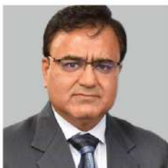
Shri KK Maheswari

Commissioner, Department of College Education, Govt. of Rajasthan.