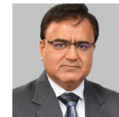
Shri KK Maheswari

Commissioner, Department of College Education, Govt. of Rajasthan.